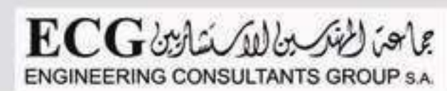
ENGINEERING CONSULTANTS GROUP