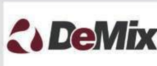
DEMIX FOR READY MIX CONCRETE